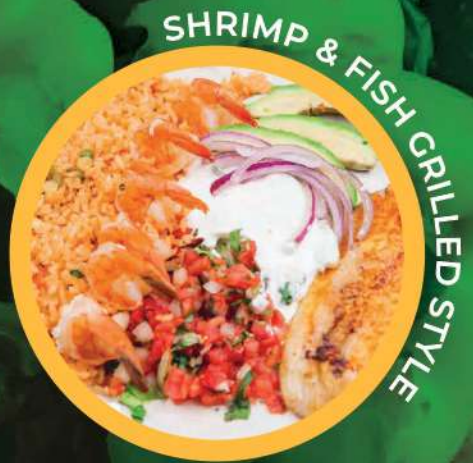
SHRIMP & FISH GRILLED STYLE

Sautéed shrimp, cooked in our very own Smokey guajillo sauce. Served with rice, lettuce, avocado, onion, tomato, and tortillas.